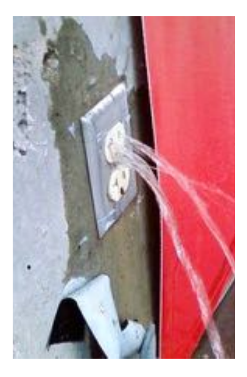
Water flowing through electrical circuits can cause severe health hazards, even death by electrocution

Water is particularly dangerous when it comes in contact with electrical wires. Even if you think or have been told that the power is off for your entire community, it is safer for everyone to turn off the electricity at your monastery's own main breaker or fuse box. That way, if someone is standing in a pool of water with exposed electrical wires, the power will not come back on unexpectedly; you can control it.