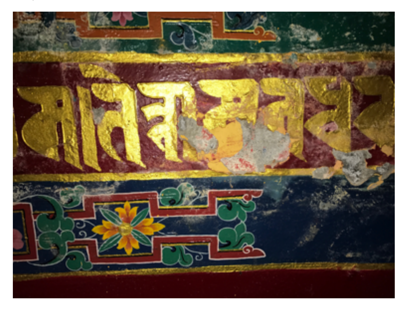
This wall painting became damaged by water. You can see the raw concrete beneath where the paint has flaked away.

Wall paintings are often where we first notice damage from water. Some wall paintings are painted on cloth similar to the methods of thangka paintings, and other wall paintings are done directly onto the wall. In either technique when the wall beneath becomes damp or wet, the wall paintings are easily damaged. Often when wall paintings are damaged, the monastery paints over the damaged paintings. However, often the damaged layers begin to flake and peel so then the newer paint also flakes and peels.