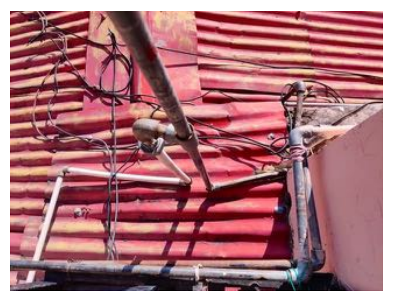
Plumbing located can break. After an earthquake, damage to exterior pipes was visible and they could be fixed; however, it was not as easy to see and fix damage to pipes located inside of monastery walls.

Water damage can also come from broken plumbing. Sinks and toilets can overflow if their drains and pipes are not maintained and kept clear. If there is an earthquake tremor, it can destroy the plumbing located inside the walls, or outside. This can damage both our monastery buildings and the treasures within.