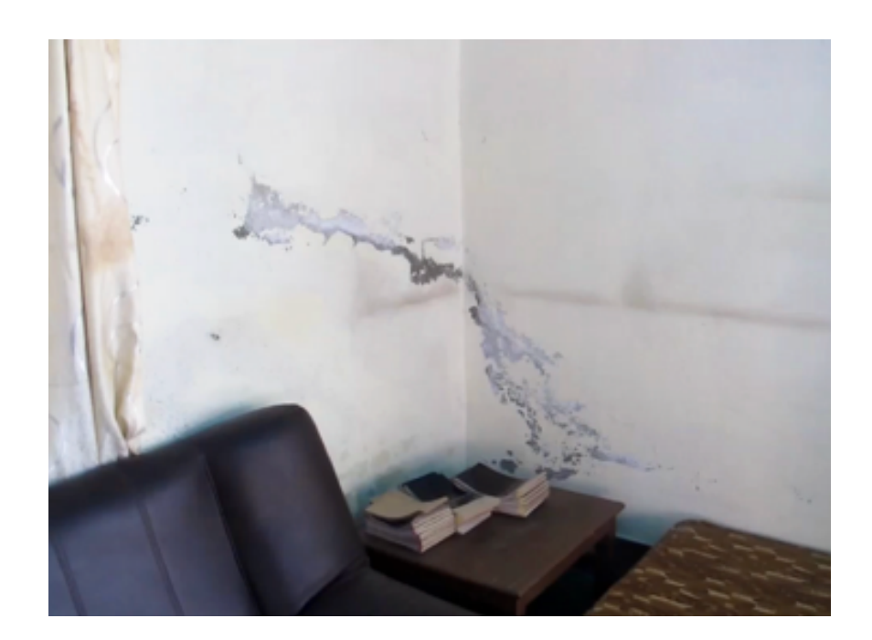
In this monastery office, dampness is rising through the concrete wall due to the damp ground outside of the building and due to earthquake damage to the building