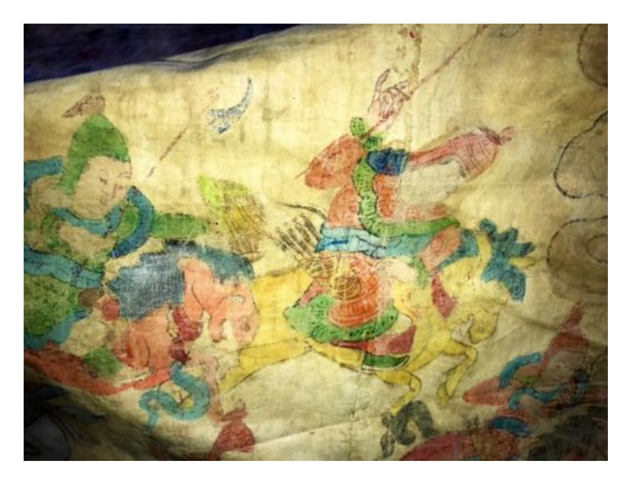
This thangka was permanently damaged when the owner tried to "clean" it with water. Most of the iconography is washed away, permanently ruined.