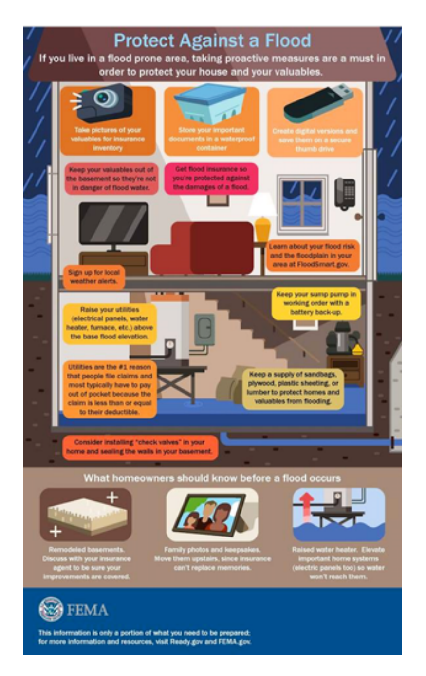
This poster has general information that can be useful for monasteries