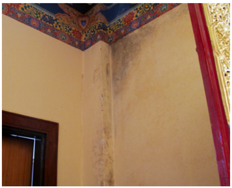
There was a roof leak up at the top and this caused mold. This is what happens when water comes through the walls.