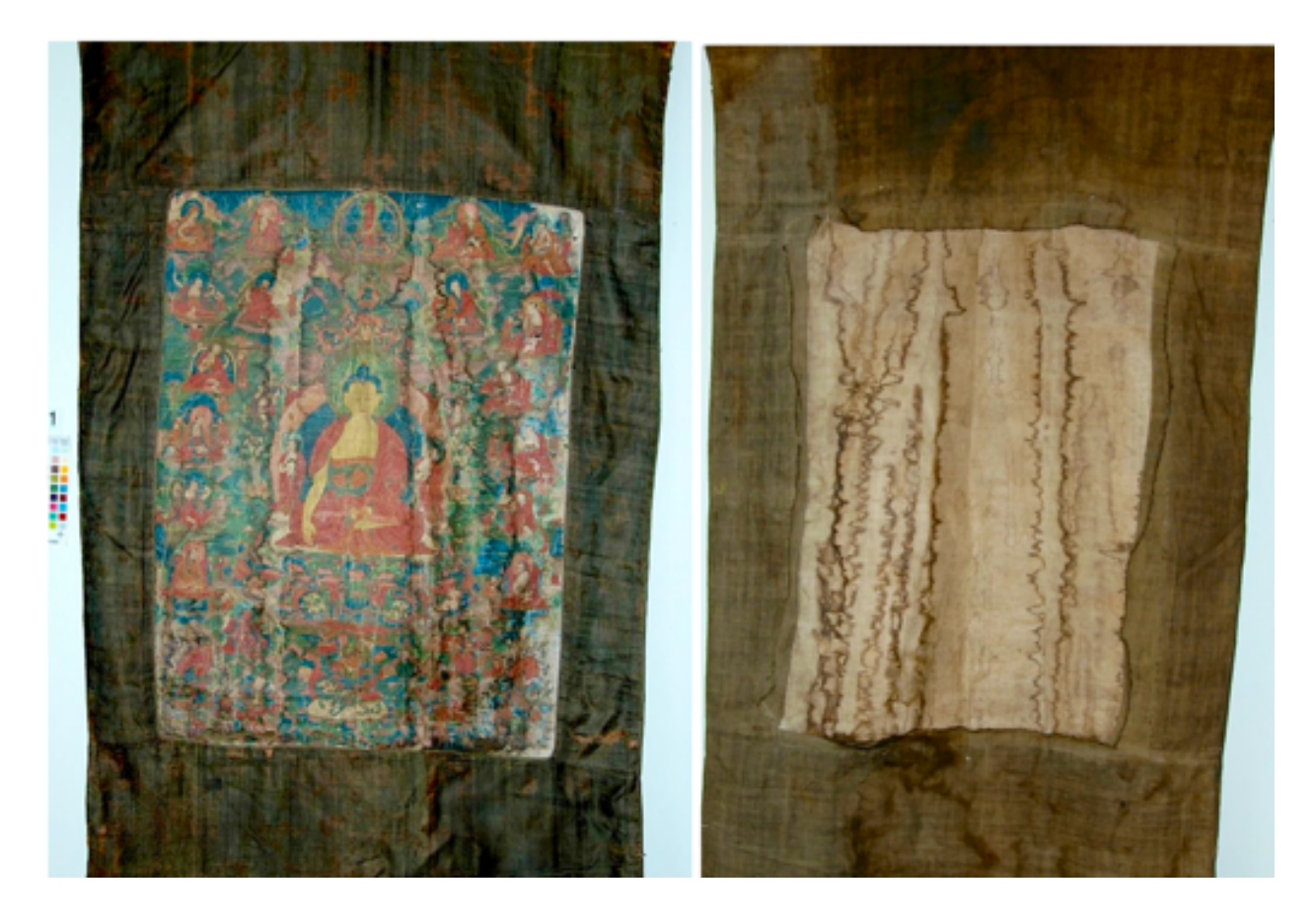
This older thangka became damaged by water when it was hung up against the old stone and clay walls in an old monastery. Then it was rolled up for storage, and the storage area flooded. Both the painting and the textile are water damaged. It is impossible to "clean" away this permanent water damage.