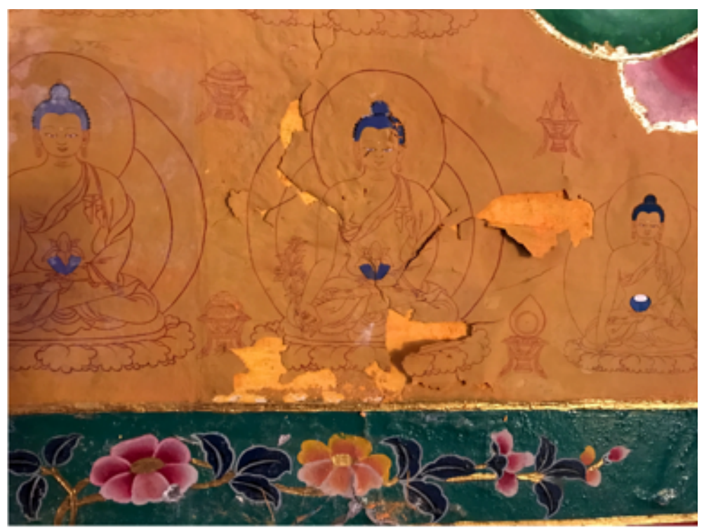
These wall paintings have been repainted many times. The paint continues to peel because the monastery walls are wet outside and the water seeps through the wall to the inside, where it damages the wall paintings.